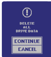
Rapid Secure Wipe Self-Destruct Mode (Optional)