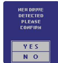
No Software or Drivers Mac, Linux and Windows Compatible